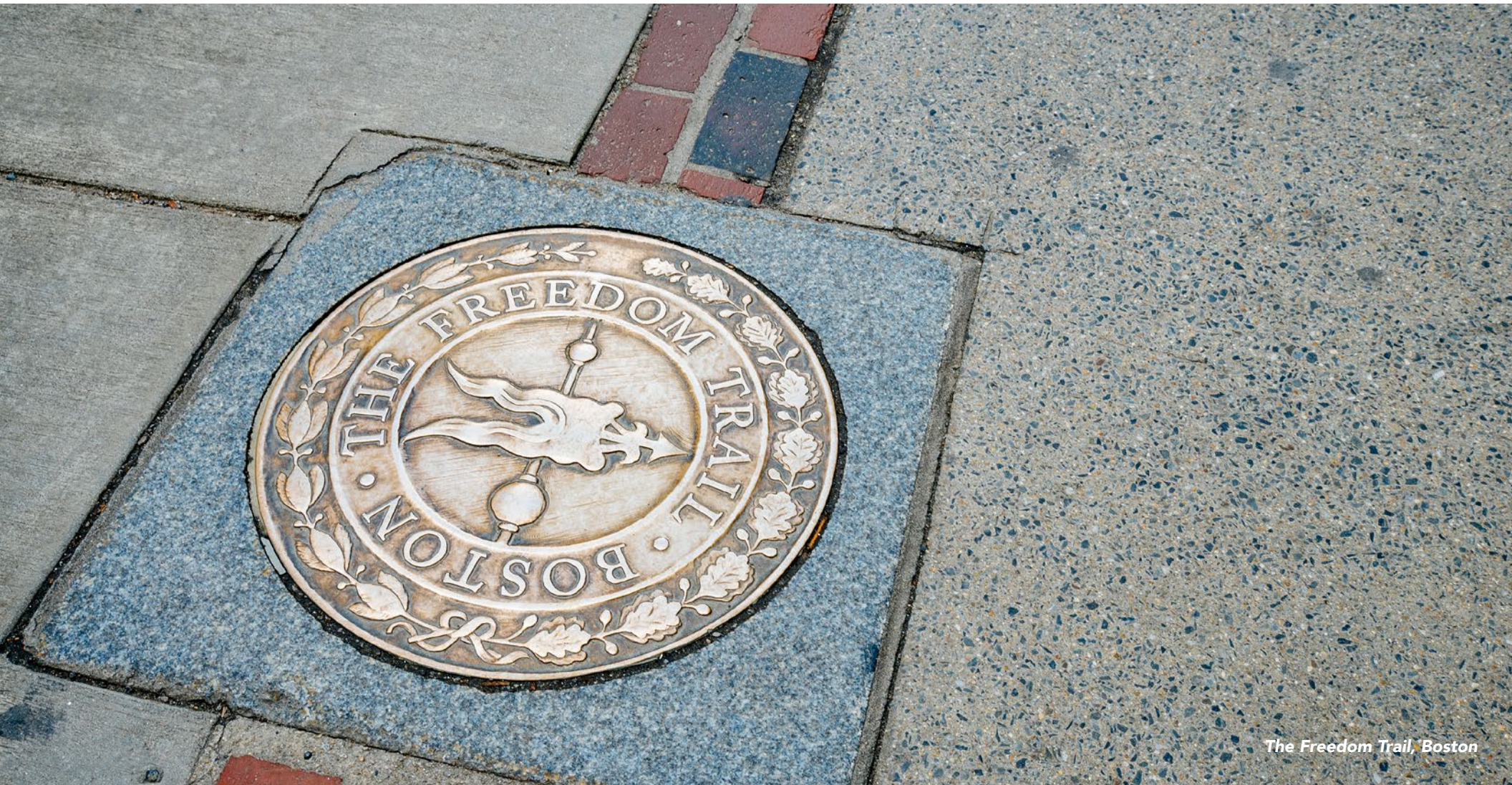
The Freedom Trail, Boston