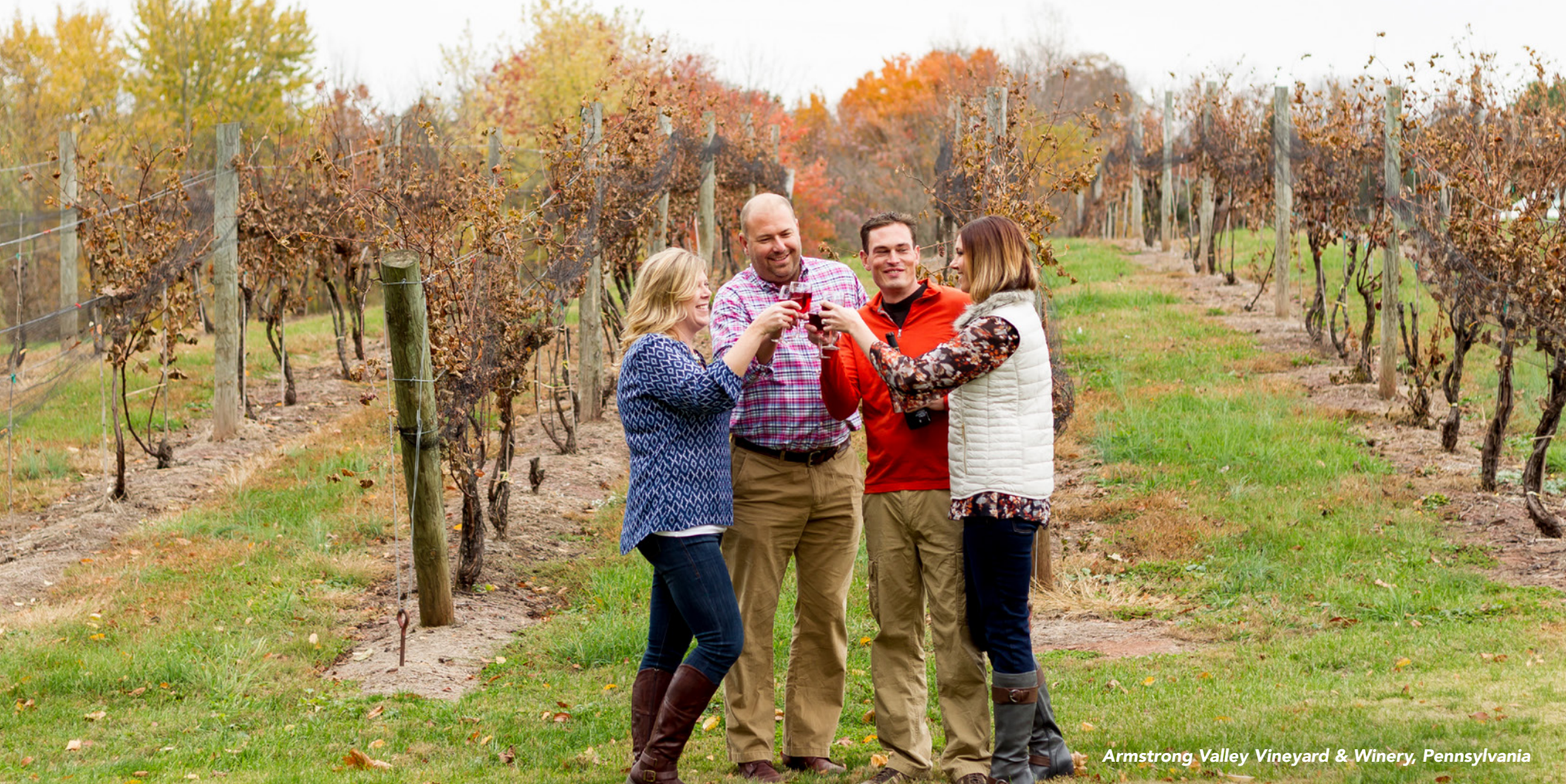
Armstrong Valley Vineyard & Winery, Pennsylvania