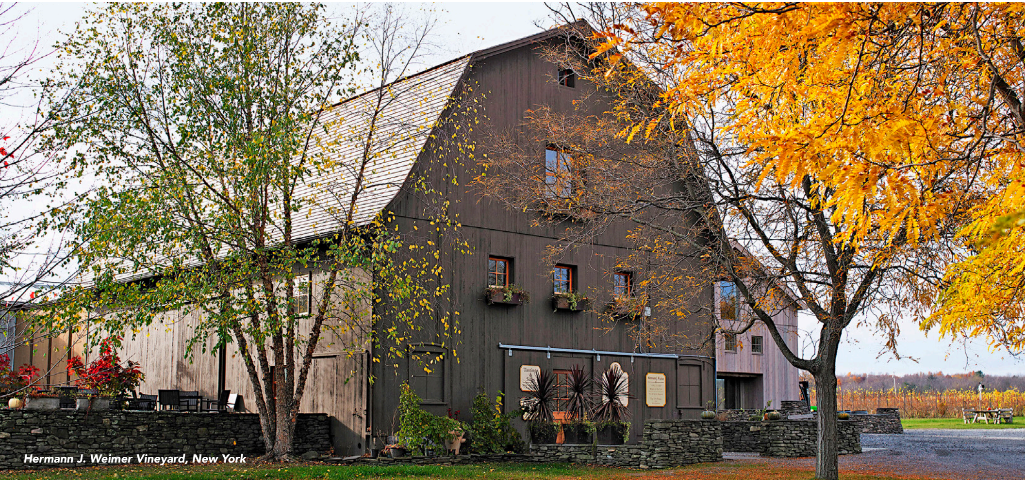
Hermann J. Wiemer Vineyard, New York