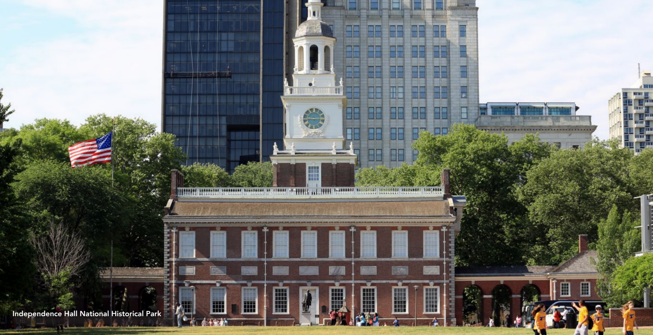
Independence Hall National Historical Park